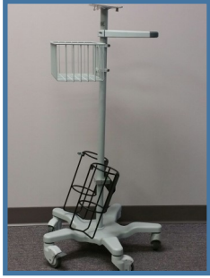
Pro-Nox E-Cylinder Mobile Cart