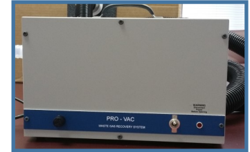
Pro-Vac Portable Scavenging System