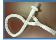
Patient Circuit with Mouthpiece