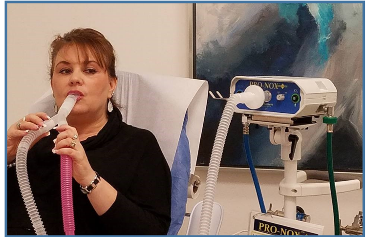
Patients using Pro-Nox in procedure rooms