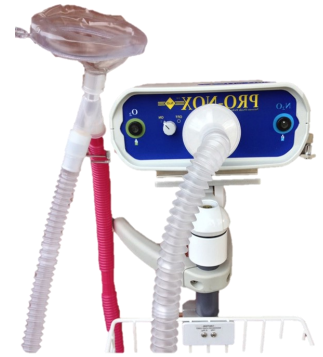
Pro-Nox Nitrous Oxide System

Studies have shown that it is non-addictive for the patient for procedures, while delaying or decreasing the need for other pain medicine. From Aesthetics, Dermatology, Plastic Surgery, Vascular, OBGYN, Orthopedics, Pain Management, Regenerative Medicine, Urology, Birth Centers, Hospitals, Surgery Centers and More ~ Pro-Nox is a great alternative for pain management.