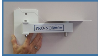
Pro-Nox Wall Mount