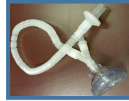
Patient Circuit with Mask